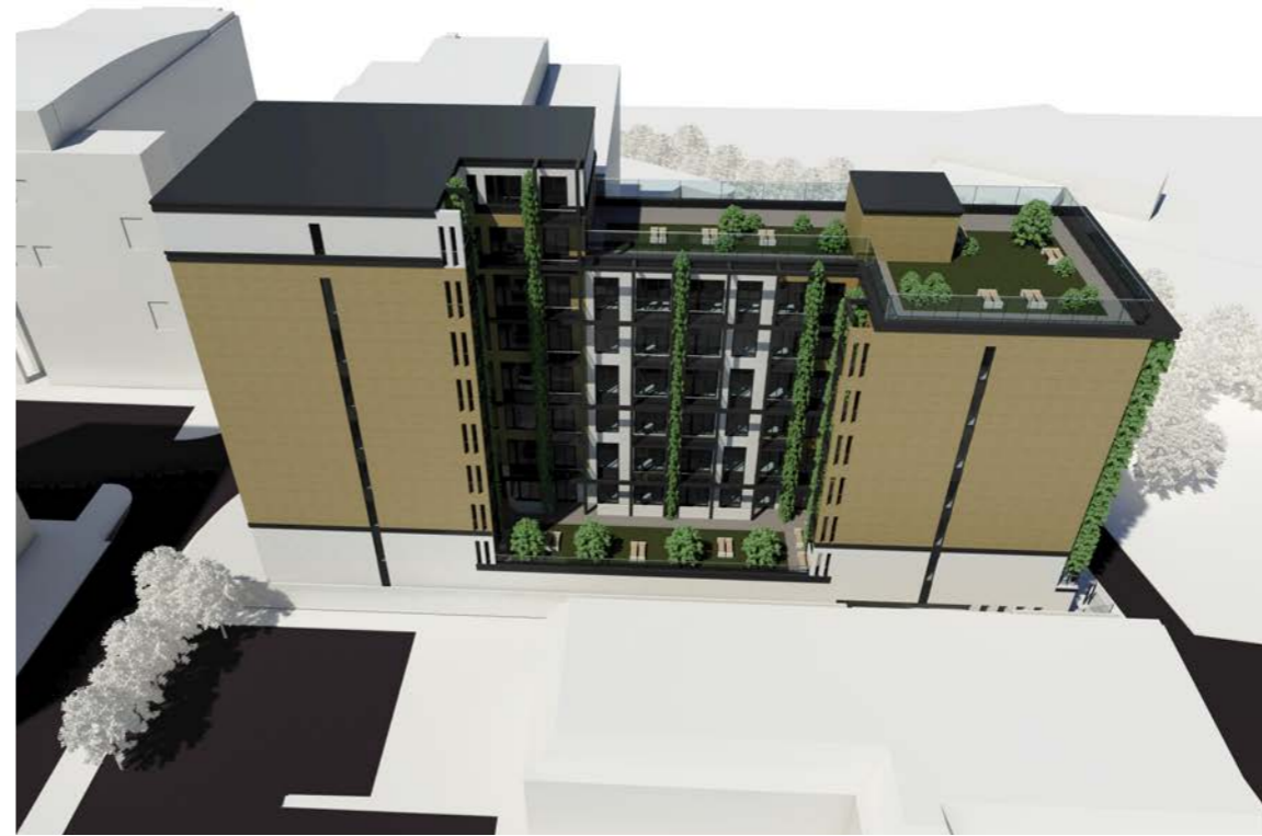
B: View of Internal Courtyard 01