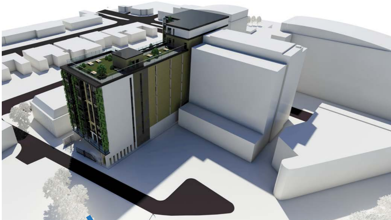
C: View Overlooking the rear of the Hotel