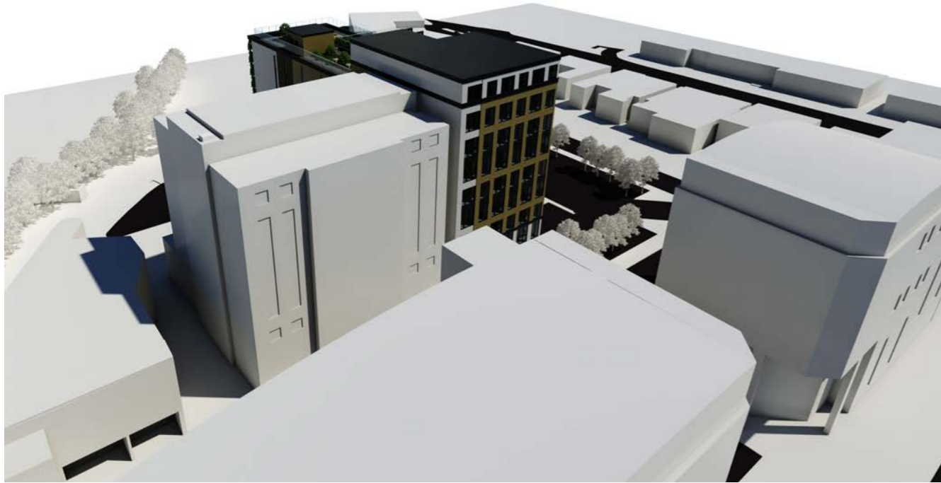
A: View from St. Albans Rd. (A412)