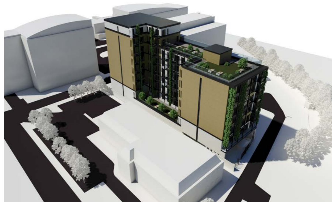
D: View of Internal Courtyard 02