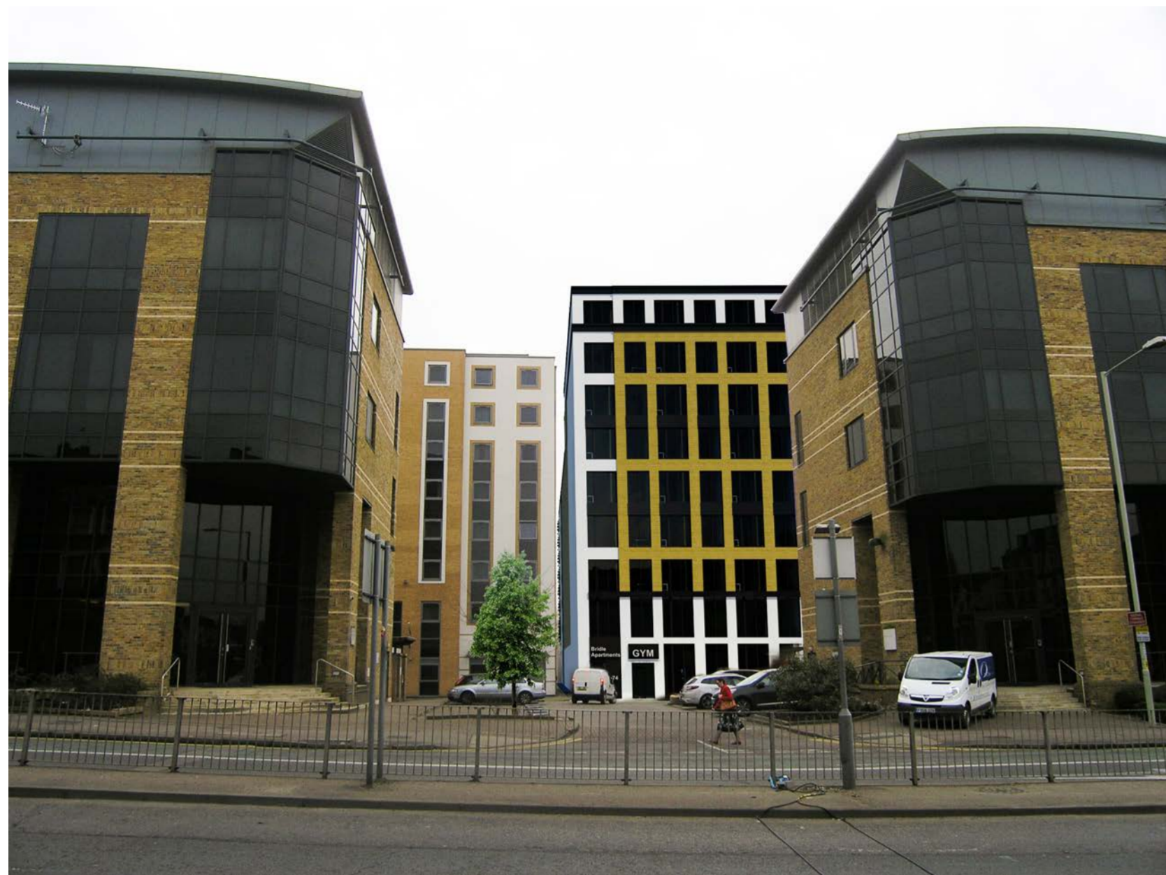
A: View from St. Albans Rd. (A412)