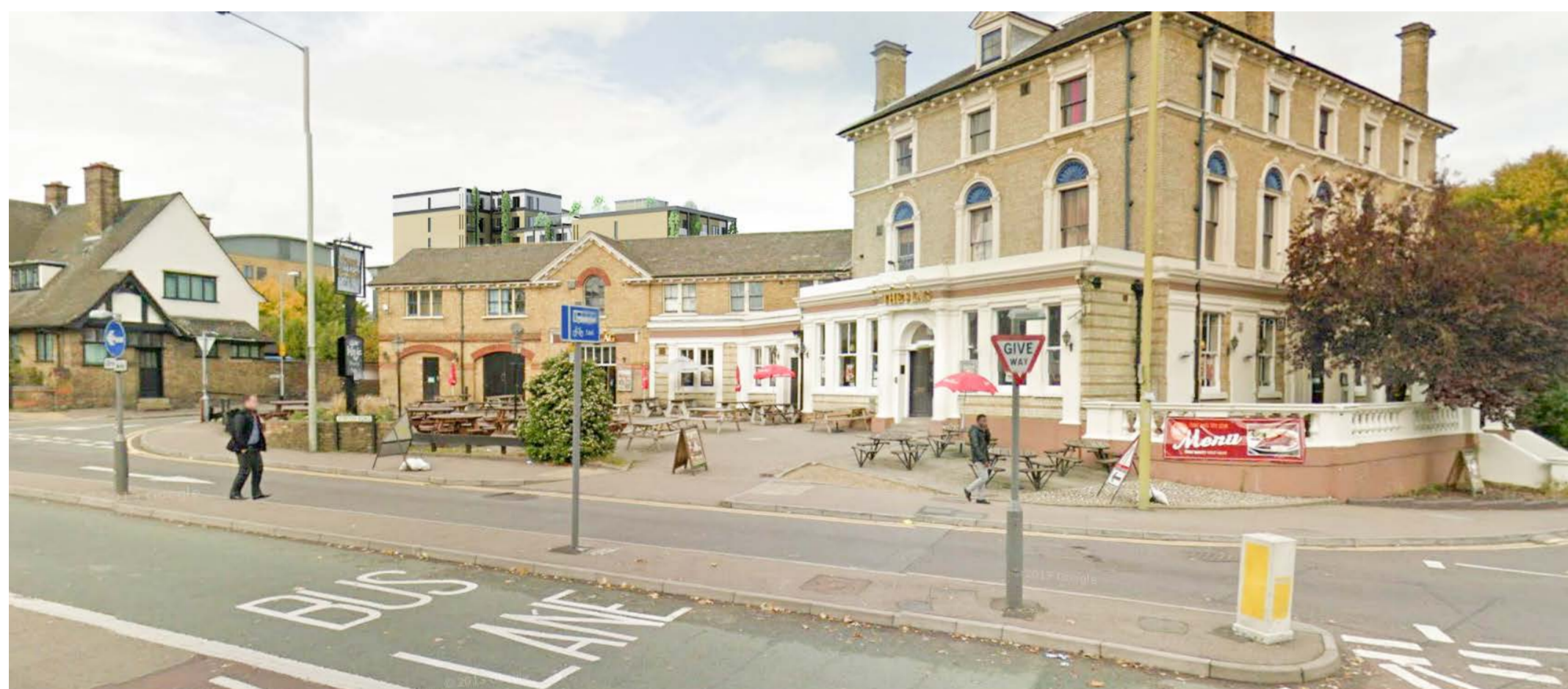
C: View from Station Rd.