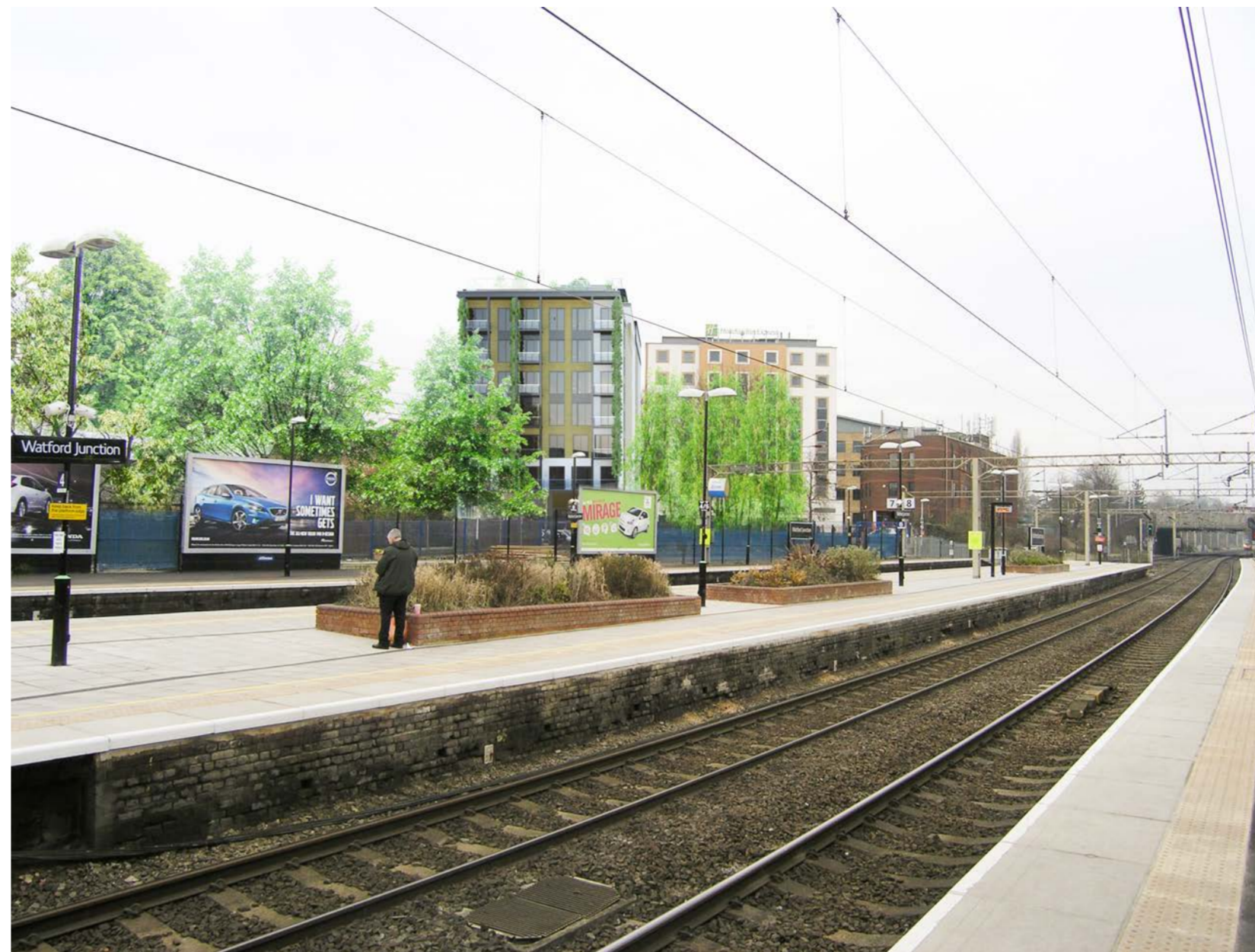
B: View from Watford Junction